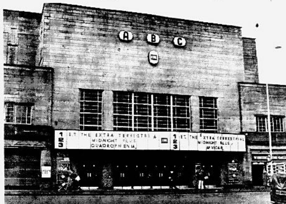
Right: Some of the Huddersfield buildings from the Wimpenny file (from top)—the ABC, formerly the Ritz; and the Technical College